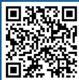
BBC Bitesize History

Use online revision tools like BBC Bitesize at home to improve your history knowledge even more.